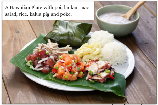
A Hawaiian Plate with poi, laulau, mac salad, rice, kalua pig and poke.